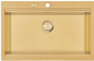
Sink Milanello Gold workstation 1034 059